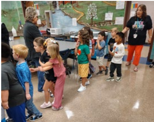
LEFT: Duck Springs Elementary Students preparing for lunch for Kinder Camp 2025.