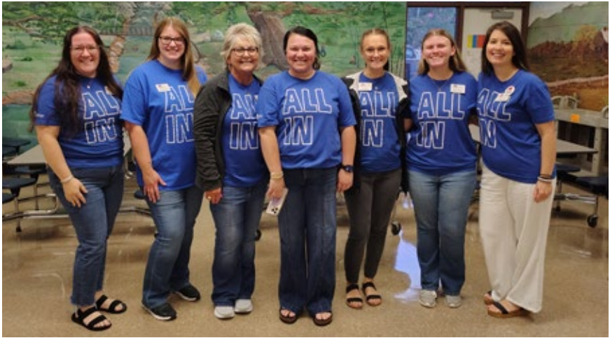
ABOVE: Family Savings Credit Union employees at Duck Springs Elementary for Kinder Camp 2025.